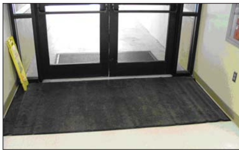
Entrance way with wet carpet.